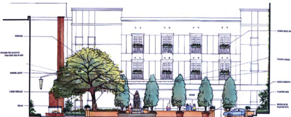
SECTION B SCALE: 1/4"=1'