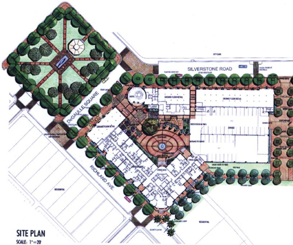
SITE PLAN SCALE: 1"=20'

CLIENT: RIVER RANCH DEVELOPMENT COMPANY SIZE: 4 ACRES SERVICES: MASTER PLANNING ARCHITECTURE LANDSCAPE STATUS: COMPLETED